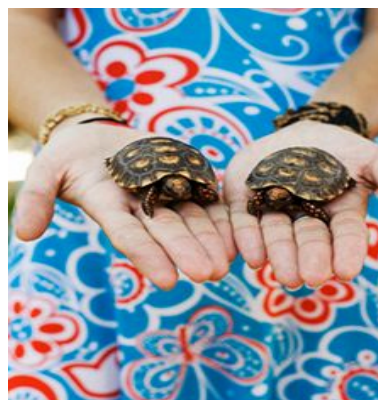
Speedy & Slowpoke