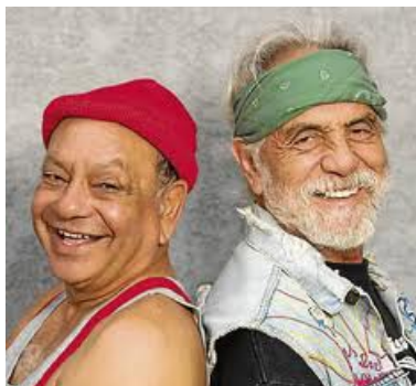
Cheech & Chong